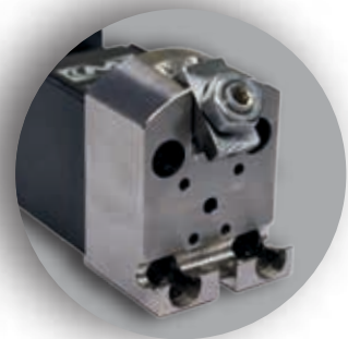
BAT25 UN Compatible Module

Module needle includes carbide ball and seat for consistency and longevity